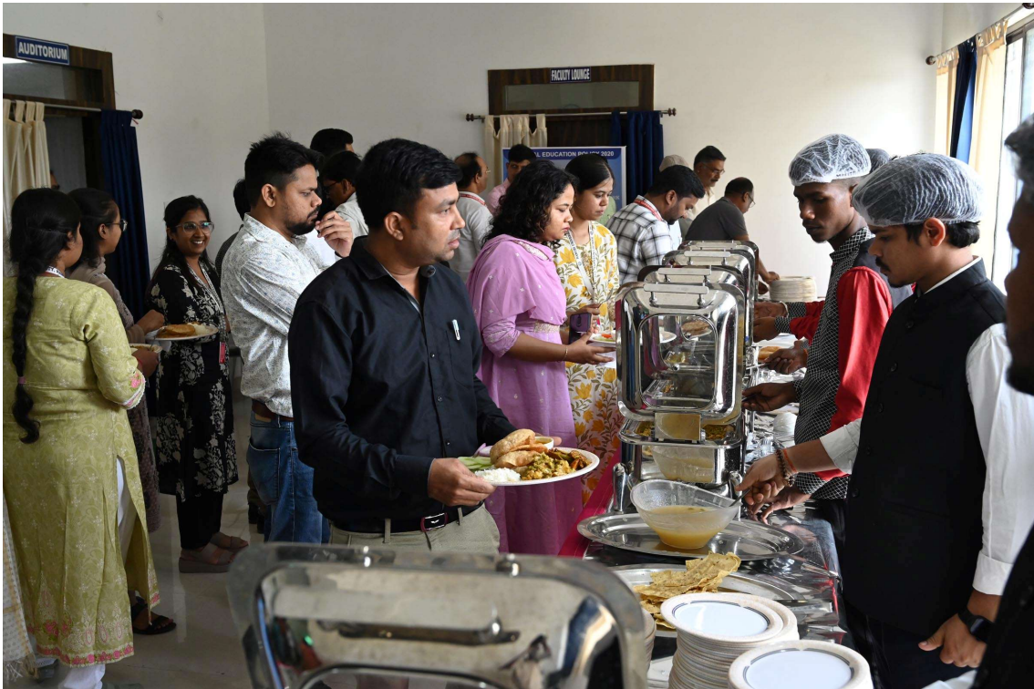
Figure 11: Lunch Session 02