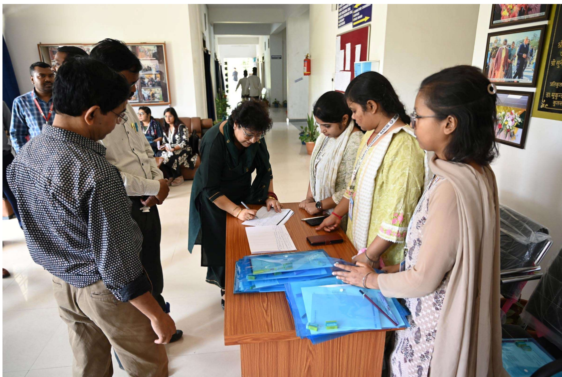
Figure 8: Registration Desk