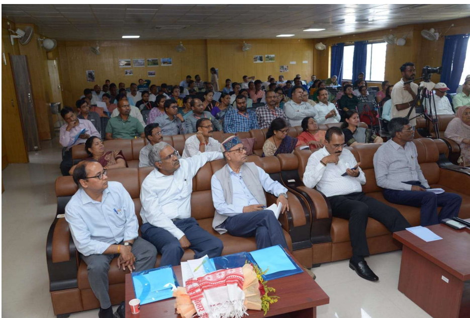
Figure 7: Moments from the Workshop