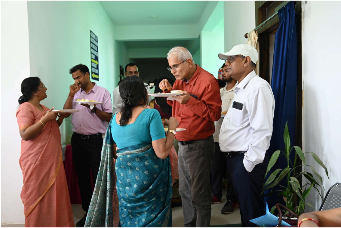
Figure 10: Lunch Session 01