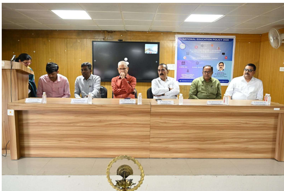
Figure 1: Hon'ble Vice Chancellor, Officers and Experts in the Inaugural Session

The Internal Quality Assurance Cell (IQAC), Ranchi University, organized a one-day workshop on the Postgraduate Curriculum Framework and Credit System in alignment with the National Education Policy (NEP) 2020. Held on 12th April 2025, the event brought together officers, Deans, Heads, Principals of different colleges and faculty from the different departments and colleges of Ranchi University, and faculty members from other institutions to deliberate on the future of postgraduate education.