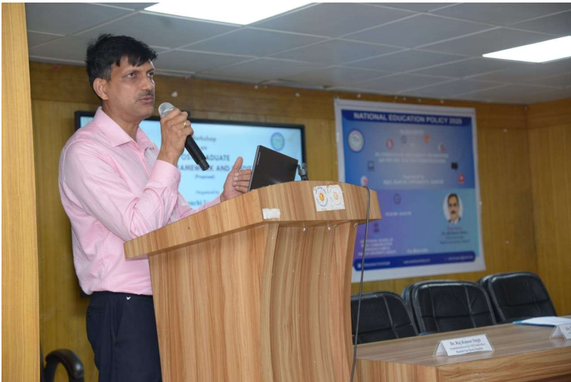
Figure 13: Session 03