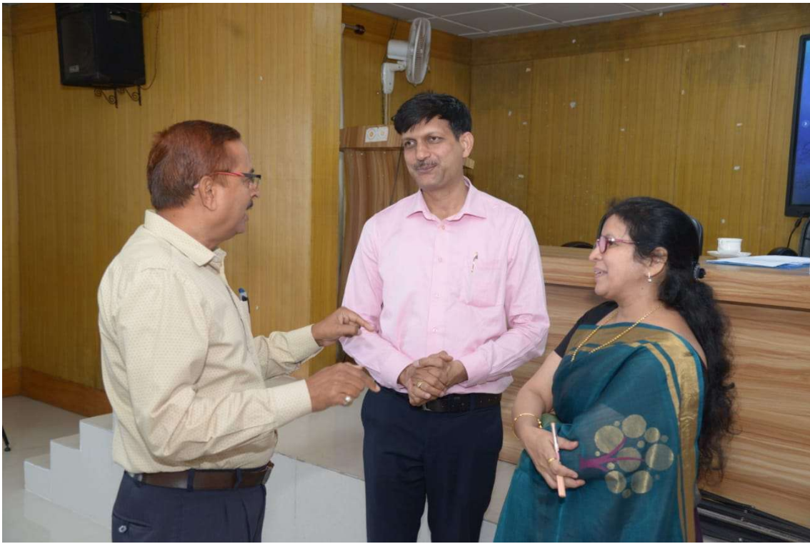
Figure 12: Discussion before Session 03