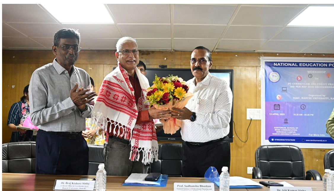
Figure 9: Welcome session- exchange of boo key